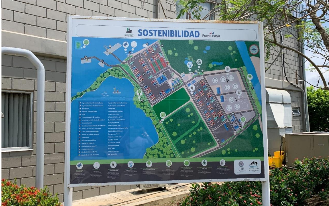
Top: Puerto Bahia During our Visit. Bottom: Puerto Bahia Map and Greenest Port Award.

Cheap Valuations + Low Liquidity + Inefficient Markets = Attractive Opportunities